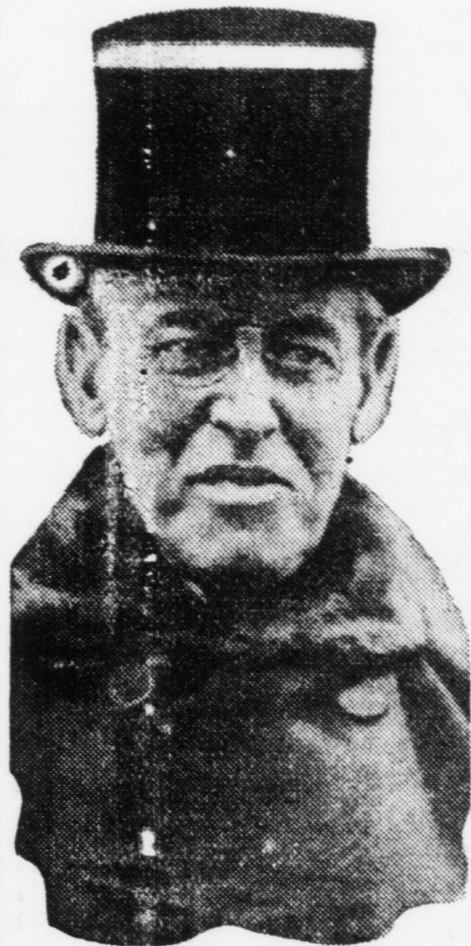
PRESIDENT WILSON'S LATEST PICTURE. (From snapshot taken on Nov. 26.)

National Preparedness Main Theme of Head of Nation. Submits Definite Plan to Increase Present Standing Force of Regulars and For Four Hundred Thousand Citizen Soldiers Raised in Increments of One Hundred and Thirty-three Thousand.