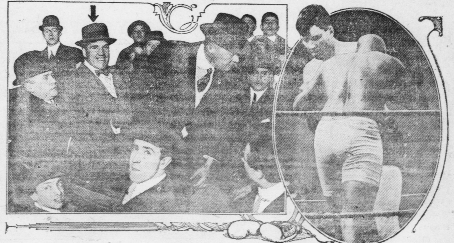
Champion Jess Willard is always greeted by mobs every time he appears on the street. Here he is seen arriving in New York after fight; also in a clinch with Johnson, which gives you an idea of Jess' huge proportions.