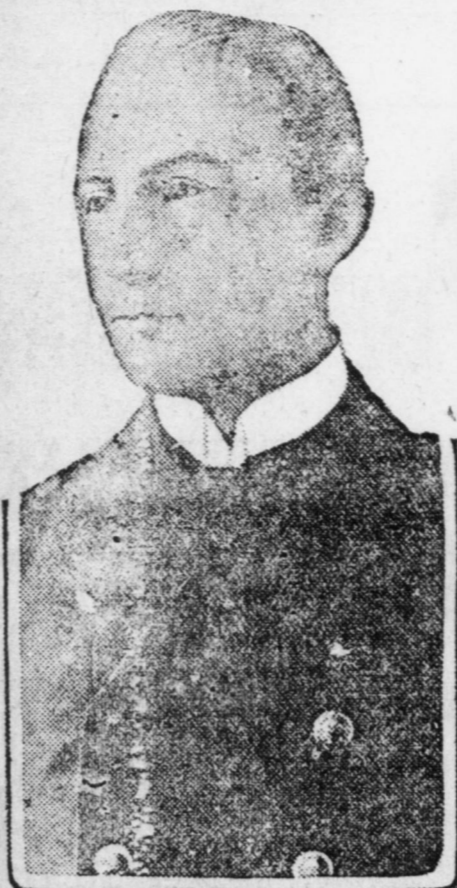
CAPT. KARL VON MULLER, Commander of German Cruiser.