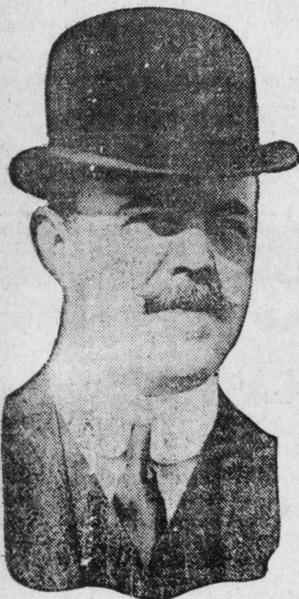
NICHOLAS LONGWORTH.

A Doleful Mood. The proprietor of a Paris cafe noticed that after he had refused to give his pianist an increase of salary the number of his customers dwindled rapidly. It was only when all but one diner had deserted him that he discovered that the pianist had been inflicting Chopin's "Funeral March" on the audience nightly. The pianist, who was proceeded against in the law courts and was fined 5 francs, pleaded that he played according to the mood he felt in after his request had been refused.