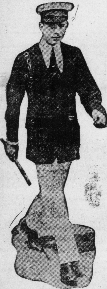
MAURICE OF BATTENBERG.

Prince Maurice of Battenberg, a cousin of King George and a son of Princess Henry of Battenberg, has been killed while serving with the British army in France. The prince was an officer of the King's royal line corps.