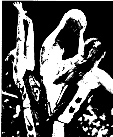
Lucas (33) attempts a shot.