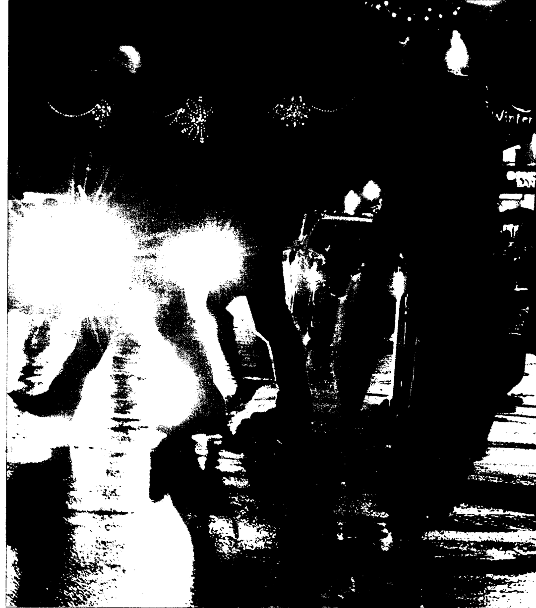
Students cross Allen Street Tuesday evening after a break from the continuous downpour during the day. The rain is expected to continue through tomorrow with a possible chance of snow showers as well, with highs of 48 degrees during the day and a low of 27 degrees at night.