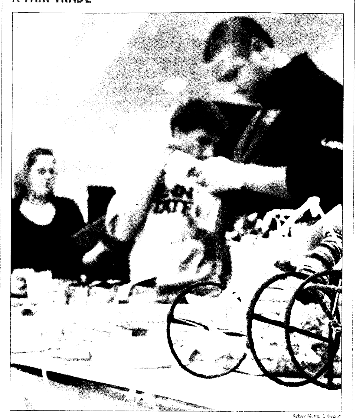
Springfield THON hosted a Ten Thousand Villages sale in the HUB-Robeson Center on Monday. Ten Thousand Villages is a non-profit organization that help artists in developing countries by giving them a good market to sell their goods. Fifteen percent of the proceeds from the sale will benefit THON.