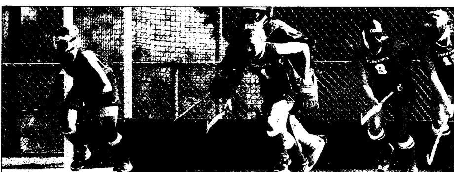
Penn State field hockey players compete in an NCAA Tournament game against Syracuse. The Nittany Lions lost the game 2-1 to end an up and down 2010 season.

It was standing room only, as 5,312 fans packed themselves into Rec Hall to see the Lions tie the 1990-94 North Carolina women's soccer team for consecutive victories with 92 - second among all NCAA sports and first for women's sports.