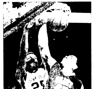
Brooks (left) slams one down.

Following a steal by Battle, Brooks took flight down the court and caught Battle's pass in stride. Brooks took two steps, rose,