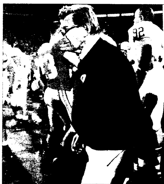
Joe Paterno walks off the field in Columbus.