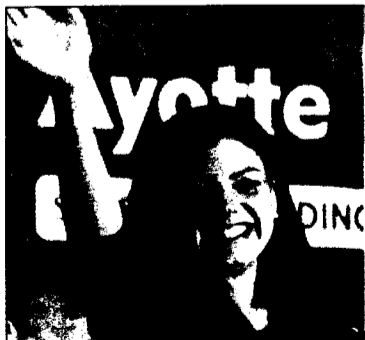
Kelly Ayotte won a Senate race.

She may have graduated two decades ago, but former Panhellenic Council president and current New Hampshire Senator-Elect Kelly Ayotte has not forgotten Penn State on her rise to political success.