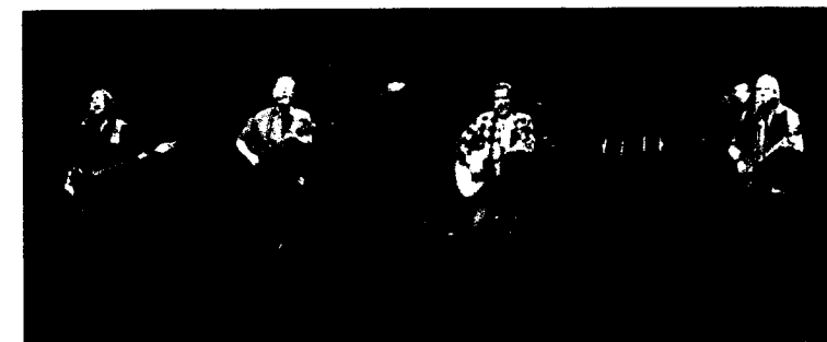
The Eagles performed on Friday night at the Bryce Jordan Center.