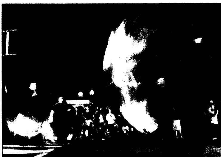
Members of the Penn State Colorguard wave flags during the Homecoming Parade 3-1 (Friday night on College Avenue).