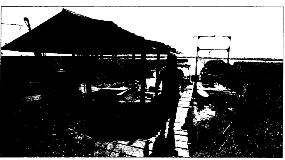
A fisherman walks on a dock in Golden Meadow, La. Students in EARTH 297H will get the chance to travel to the Gulf of Mexico to see the factors and effects of the BP oil spill.