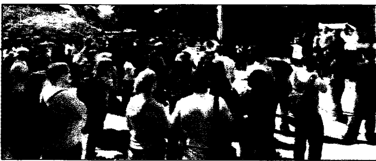
Students gather for UPUA's "Every Lion a Shrine" march last year.