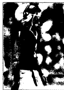
Sukay last weekend.

The presence of Alabama running back Trent Richardson makes stopping the passing game even more difficult. The Alabama sophomore