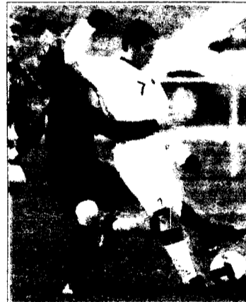
Braga (7) dribbles the ball.