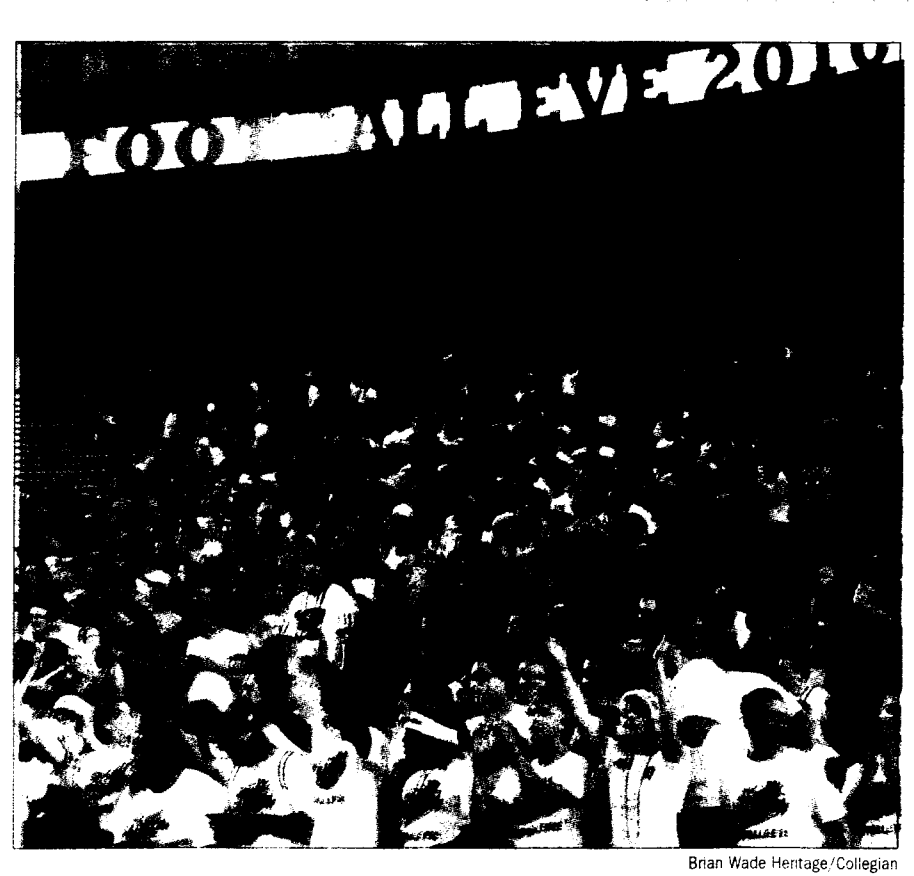
The annual Football Eve celebration drew a crowd to Beaver Stadium on Friday night.