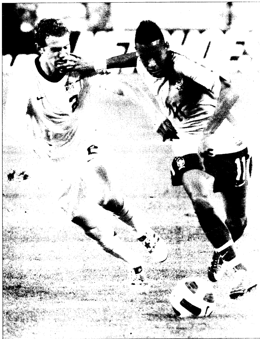
Brazilian midfielder Neymar (right) dribbles past United States defender Jonathan Spector during the first half of an international friendly Tuesday. Brazil defeated the U.S. 2-0.

We at the Daily Collegian say, "bring it on."