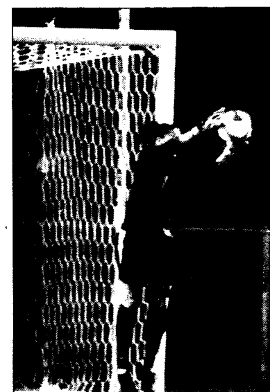
Alyssa Naeher makes a save.