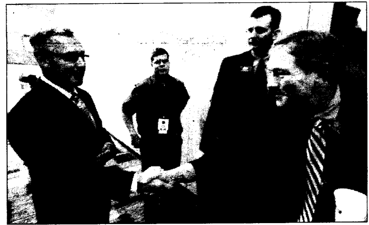
Jim Tressel (left) and Kirk Ferentz shake hands at Big Ten Media Day.