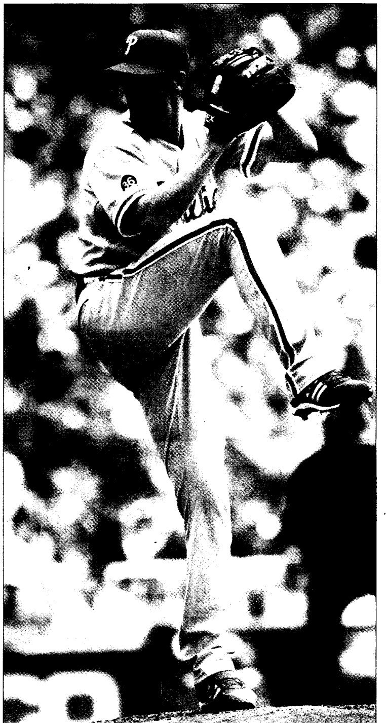
Cole Hamels winds up for a pitch Sunday in Washington.