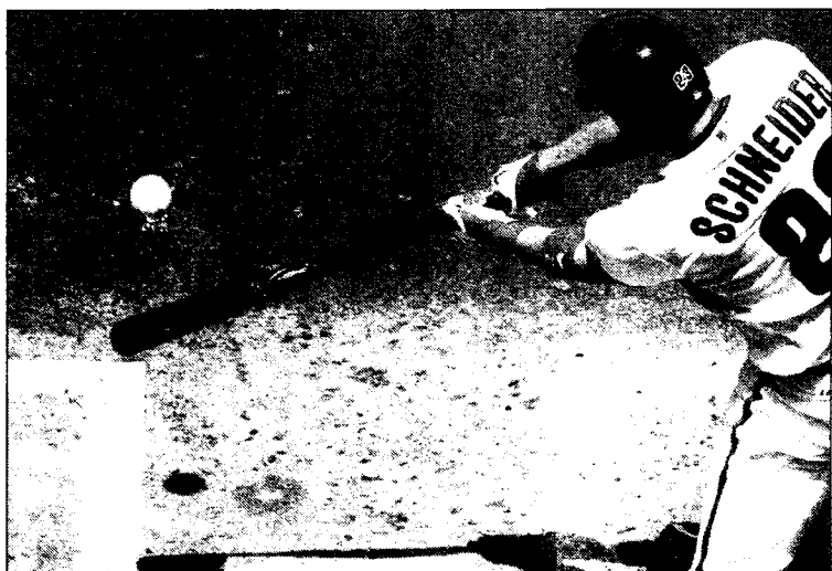
Brian Schneider hits a two-run triple in the second inning Monday. Schneider knocked in two runs and scored two more in the win.

Colorado first baseman Jason Giambi then made errors on consecutive plays. First, he dropped Hammel's throw on Blanton's comebacker. Next, Giambi fielded a grounder by Jimmy Rollins but threw low to shortstop Clint