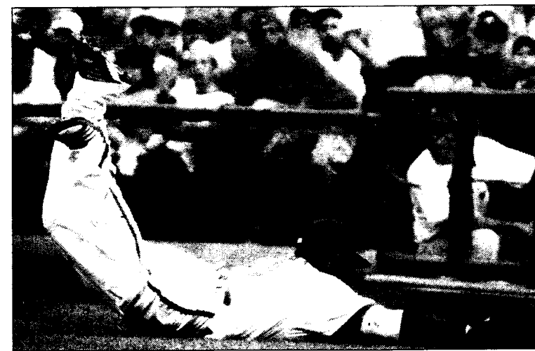
Ryan Howard dives for a foul ball in the fifth inning.

The Rockies threatened against Brad Lidge in the ninth, but the closer recorded his ninth save in 12 chances.