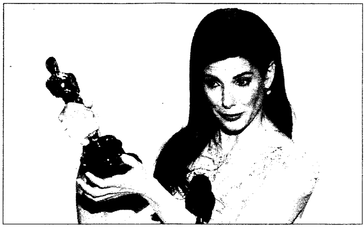
Sandra Bullock received a restraining order against a stalker on Monday.

According to the court filing, Weldon turned up in a Wyoming emergency room last month SC-