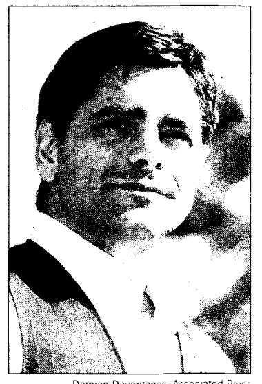
Stamos, 46, said there were never any pictures of him with cocaine and strippers.

"I don't think Shakespeare courtroom to hear the verdict but could write a story to set up a fake