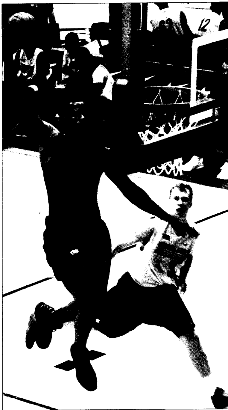
LeBron James (airborne) prepares to dunk at his camp this week. James announced he would sign with the Miami Heat Thursday night.

Thursday's answer: 1978 was the last time two teams that had never won a World Cup met in a World Cup Final when Argentina defeated the Netherlands 3-1.