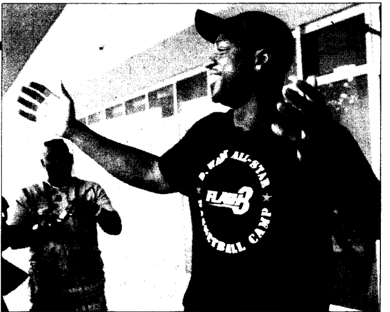
Dwyane Wade reacts to a fan rally outside his basketball camp Tuesday.

Consider how awkward that would have been: Mourning as a Heat executive involved in the recruiting of free agents, sitting alongside Wade, both of them insisting they wanted the sole