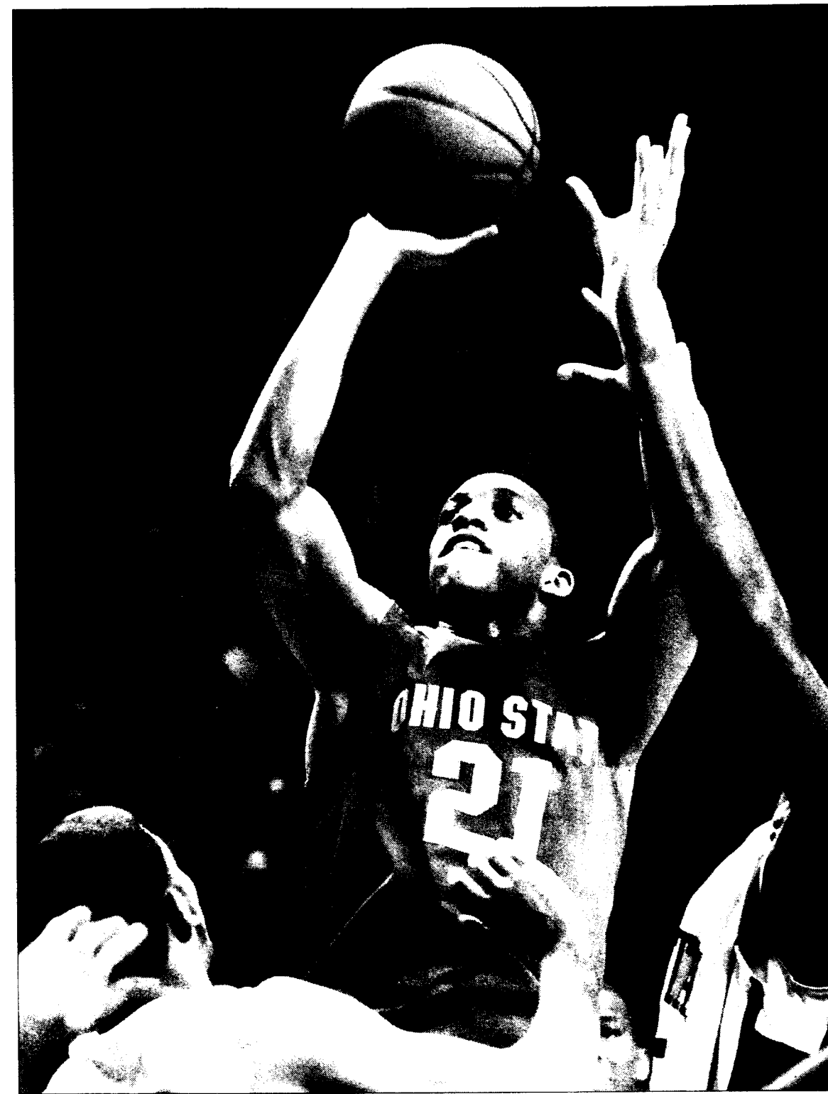
Ohio State's Evan Turner goes up for a shot over a pair of Penn State defenders Wednesday night at the Bryce Jordan Center. The Buckeyes beat the Nittany Lions, 75-67. Turner scored 25 points.