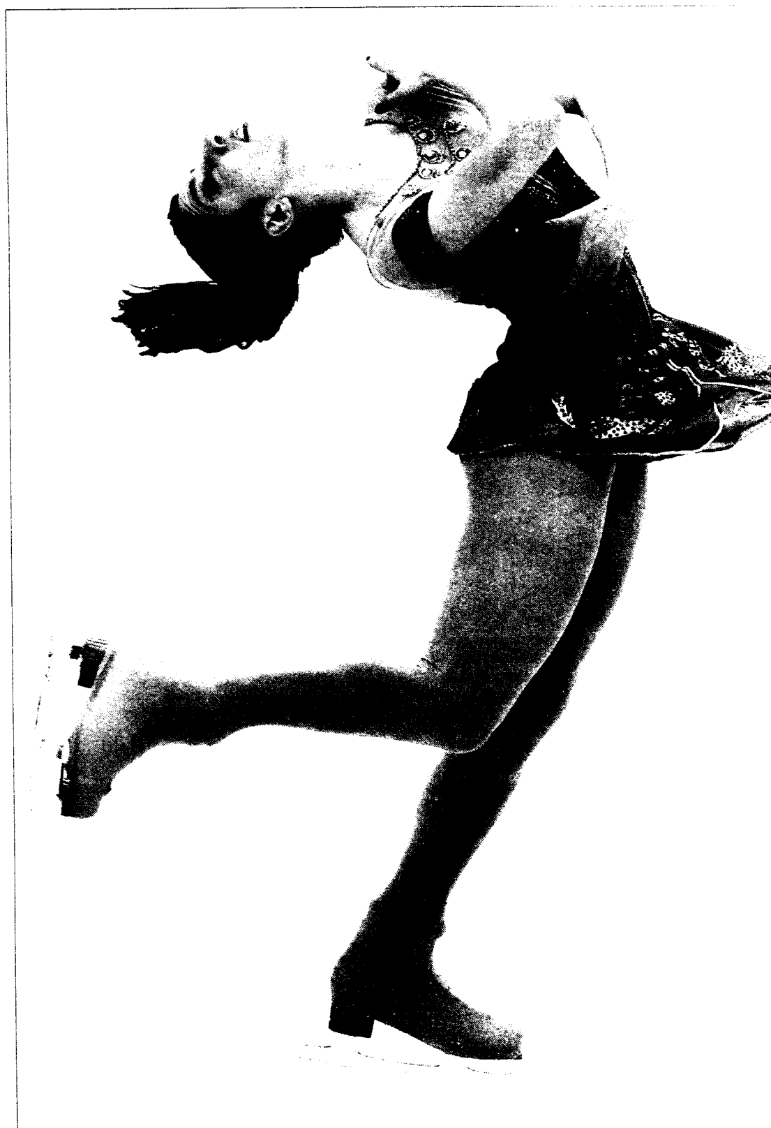
Turkish figure skater Tugba Karademir in Vancouver, short program Tuesday night during the women's figure skating competition at Pacific Coliseum in Vancouver, Canada, for the Winter Olympics. Tuesday marked the opening round of the women's short program, with the free skate coming Thursday.