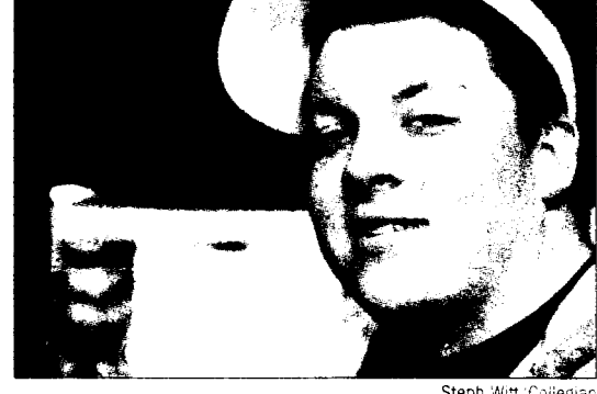
Howley pledged to donate a dollar for every new follower on the @abolishcancer Twitter page Friday.