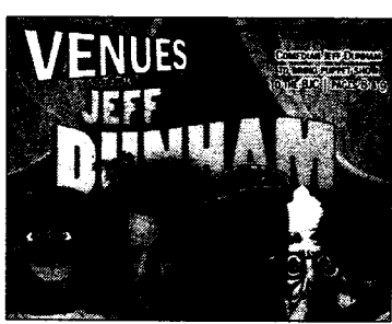
Cover Design by Brittany Fortese