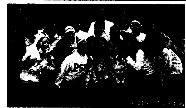
▲ LOOK MA, 'NO JAZZ HANDS'!

The Singing Lions will perform a cabaret-style show at 8 p.m. Saturday in Esber Recital Hall. | Page 15