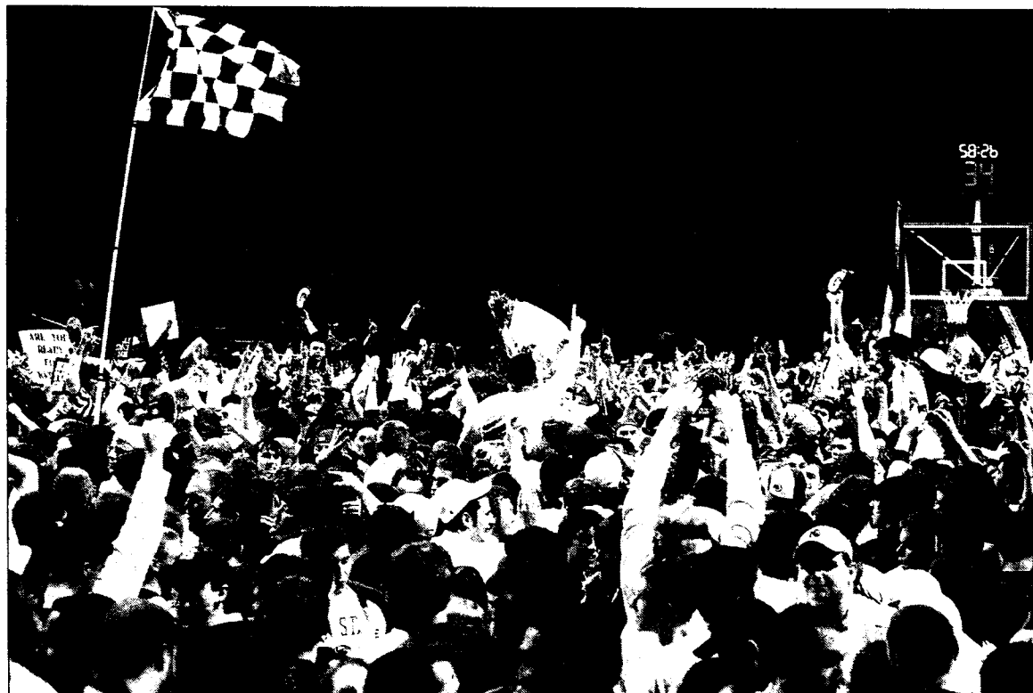
Penn State fans storm the Bryce Jordan Center court last March after the Nittany Lions beat Illinois, 64-63, on a buzzer-beating shot. The win helped the Lions earn a berth in the NIT, which they went on to win last April.