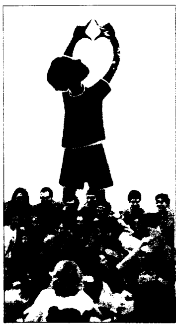
The Thon Overall Committee poses with the newly unveiled Thon logo in the White Building.