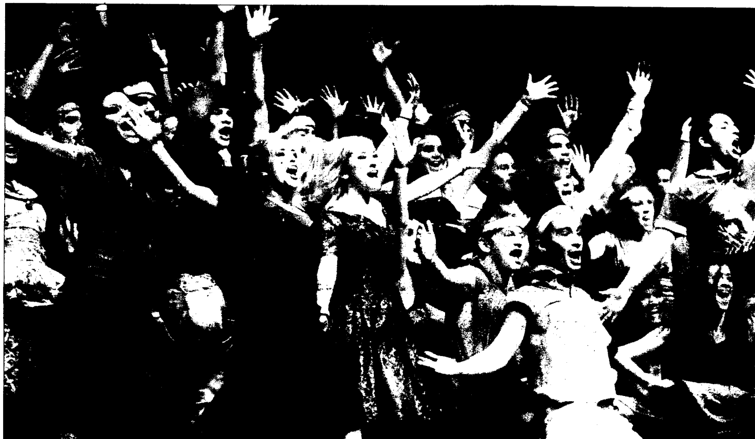
Members of Pi Beta Phi, Sigma Pi and Kappa Alpha Psi Fraternity, Inc., perform a number from "The Wedding Singer" on Sunday afternoon at Greek Sing in Eisenhower Auditorium. The members won the most spirit points and best costume categories.