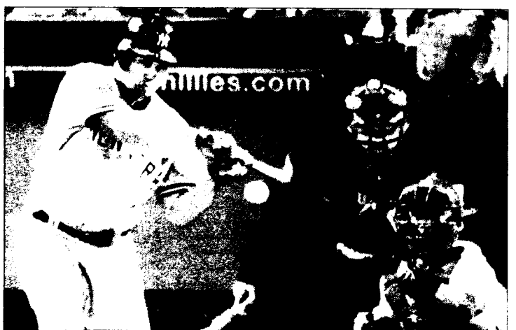
New York Yankees' Johnny Damon singles to drive in Melky Cabrera in the fifth inning of Game 4 of the World Series on Sunday in Philadelphia. The Yankees need one more win to claim their 27th title.

PHILADELPHIA — Brad Lidge's perfect postseason turned ugly. In his first World Series appearance since striking out Eric Hinske to clinch the title last year, Lidge gave up three runs in the ninth inning and the Philadelphia Phillies lost 7-4 to the New York Yankees in Game 4 on Sunday night. The Yankees have a 3-1 lead and can clinch their 27th title in Philadelphia tonight. Lidge had turned around a nightmare season by going 1-0 with three saves in three chances this postseason. He didn't pitch in the first three games against the Yankees before entering a tie game in the ninth. After retiring the first two batters, the hard-throwing right-hander fell apart. He nearly struck out Johnny Damon on a 2-2 pitch that barely missed. Damon then lined a 3-2 pitch to left for a single.