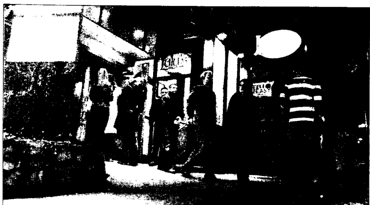
Patrons of Tony's Big Easy and Lulu's Nightspot come and go on a weekend night. The bars have shut down for the second time this year.