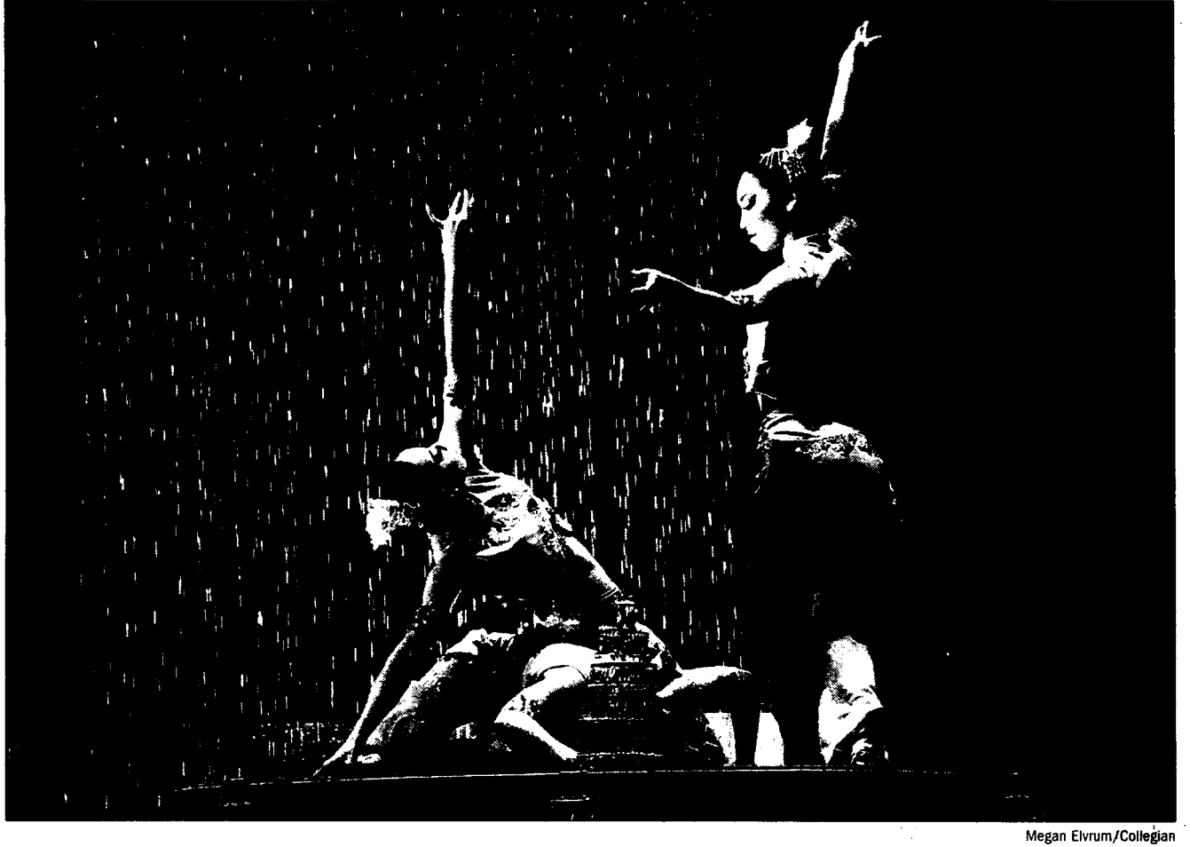
The National Acrobats of Taiwan perform in Eisenhower Auditorium. The group, which appeared on campus Thursday night, uses household items such as chairs, plates and poles for entertainment purposes.