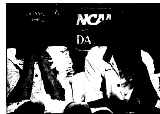
Penn State players react during the final minutes of their loss to Liberty last night.

crowd — largely ignoring the performance at first and talking among themselves, yet managing an applause between songs.