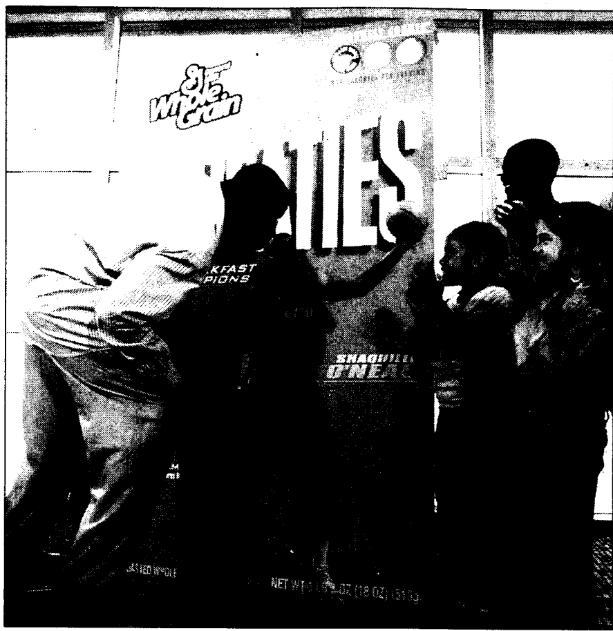
Miami Heat's Shaquille O'Neal kisses the top of his head on a Wheaties cereal box in Miami. The company added him to their sports lineup on the cereal boxes.