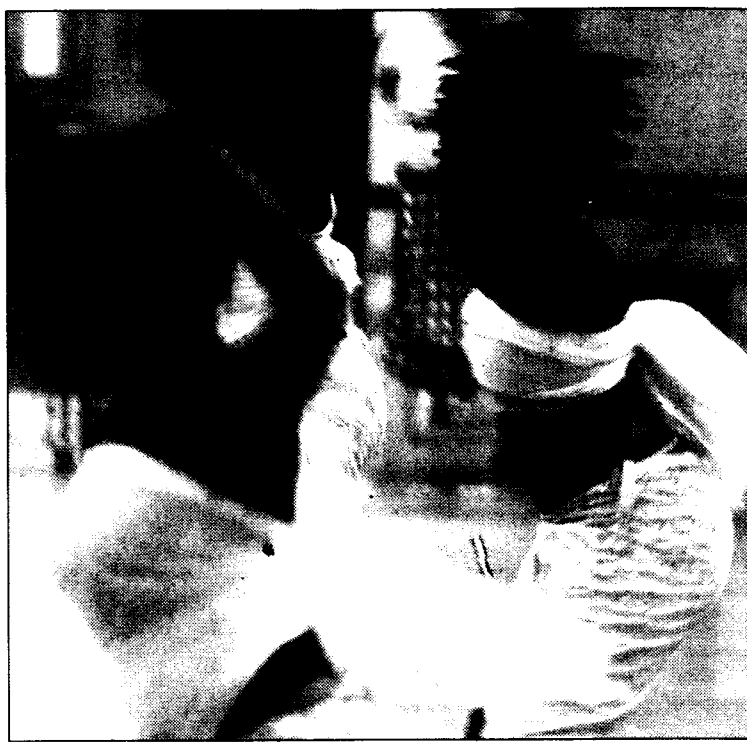
The group NOMMO performs its routine in the White Building.

The dancers' arms fly above their heads then sweep the ground while the sound of their bare feet pounding the hardwood