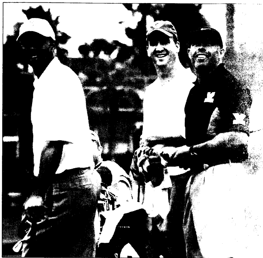
Tiger Woods (left), Peyton Manning (center) and Woods' caddy Steve Williams in a practice round during the Bay Hill Invitational Pro-Am in Orlando, Fla.