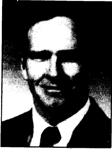
Dan Gable legendary Hawkeye coach

Each of the 11 conference teams has a home in the Amateur Wrestling News Top 25. Now, a look at each of the competitors.