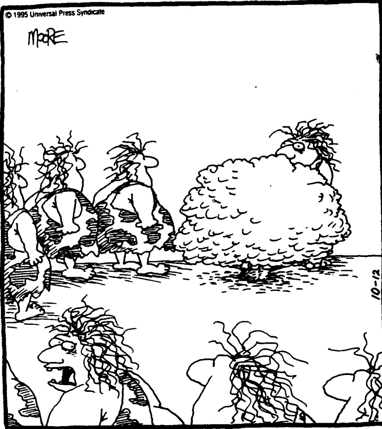
"This why I hate coming to stadium ... always long line for restroom."