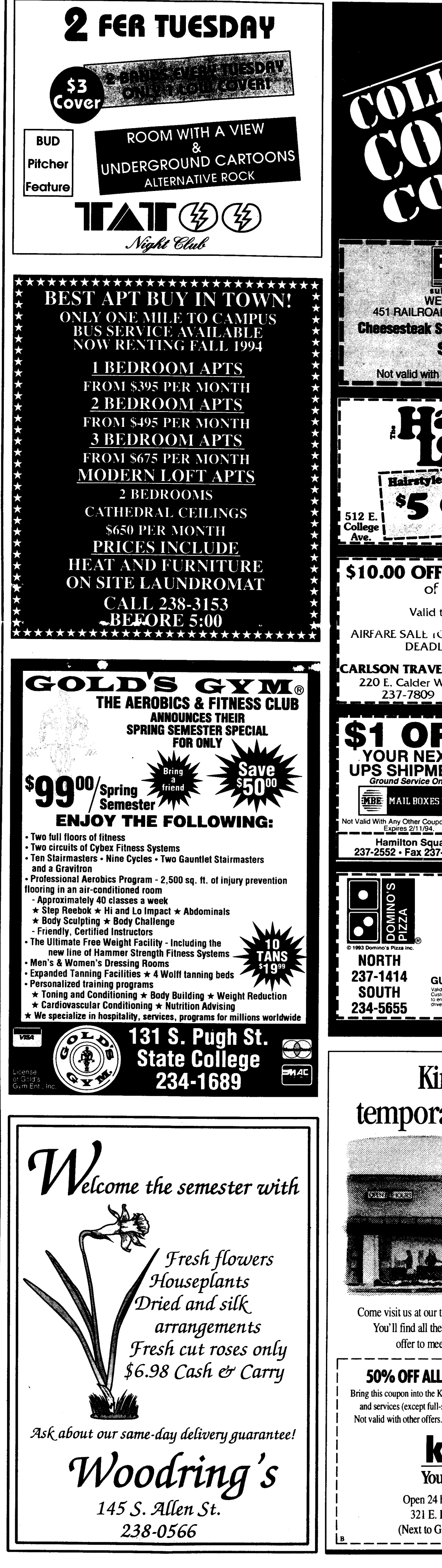
The Daily Collegian Tuesday, Jan. 11, 1994-3