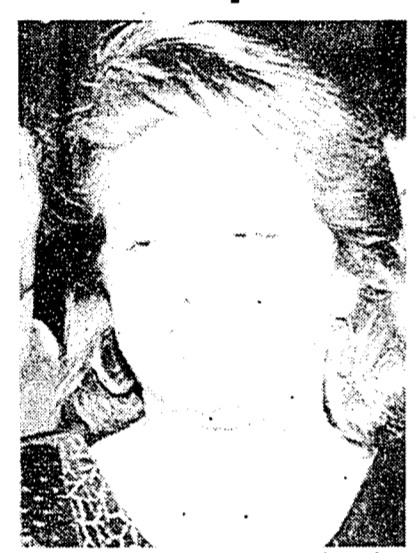
Mary Lou Retton

It wasn't too long ago when the idea of women doing activities that were considered "male-oriented" was about as popular as the Pitt football team is in Happy Valley.