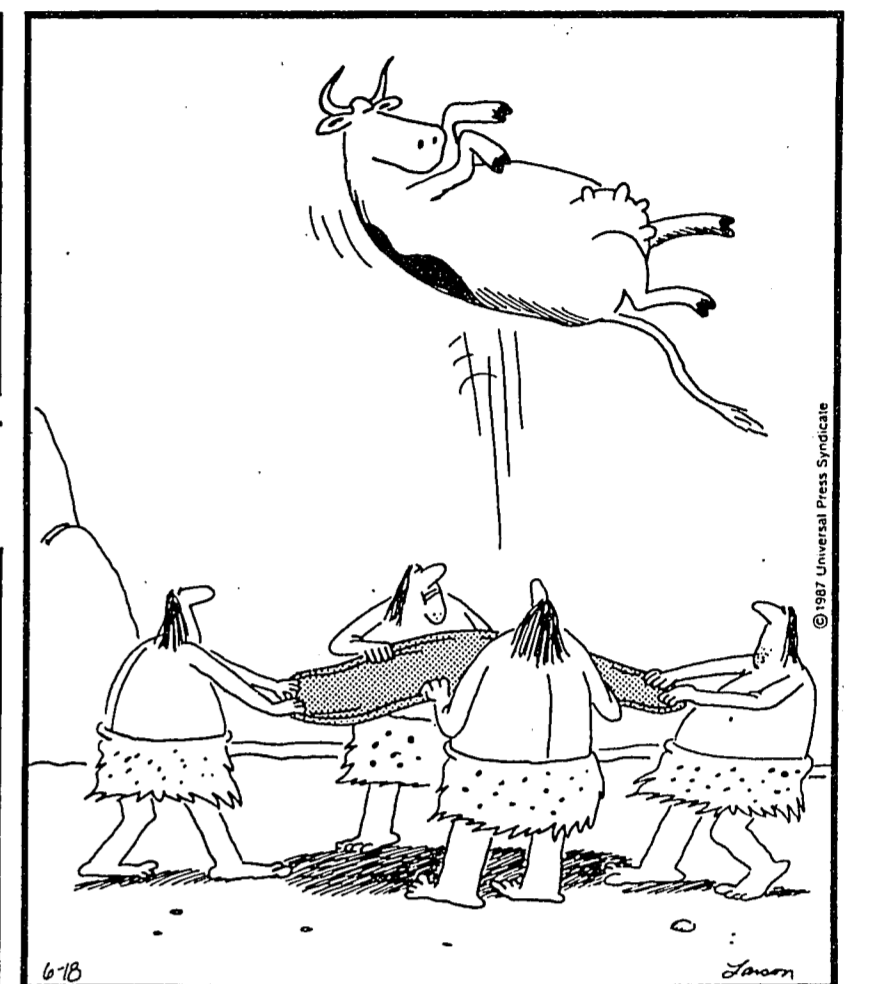
Early attempts at the milkshake