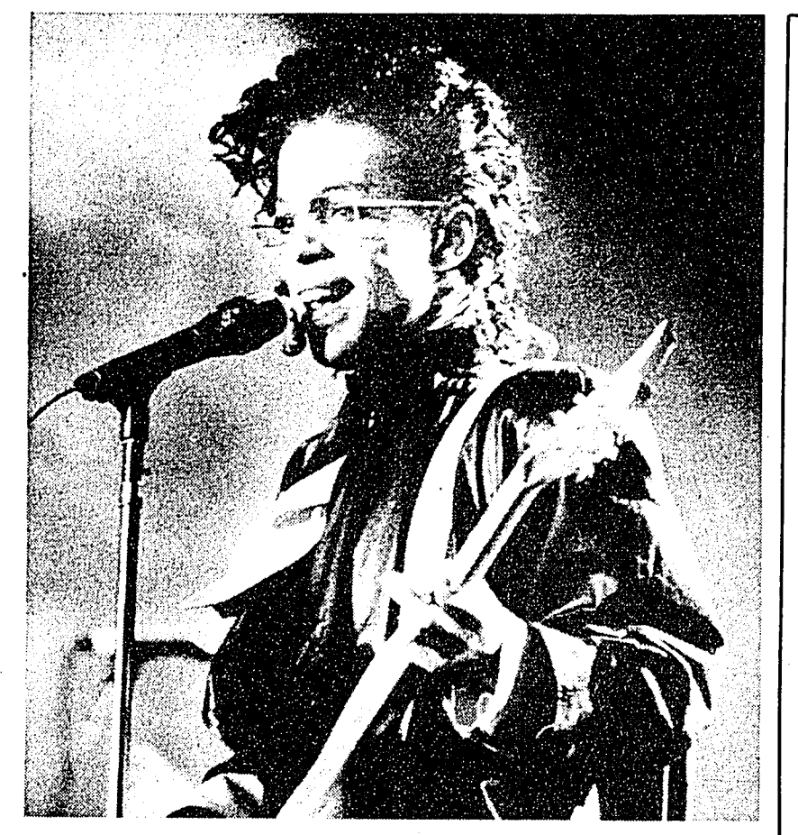
Prince plays Paris Prince performing Sunday evening at the Paris Bercy stadium on part of his "Sign 'O the Times" tour.