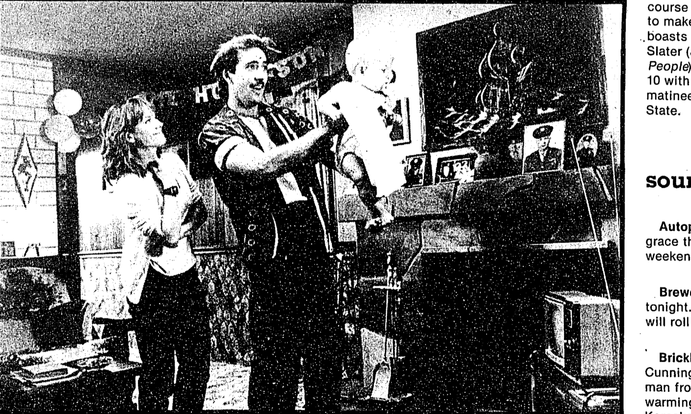
Holly Hunter and Nicolas Cage become proud parents through an outrageous kidnapping scheme in Raising Arizona. They plot to get their baby, Nathan Arizona Jr., from a set of newborn quintuplets. An original and campy comedy results from this innovative, fun story.