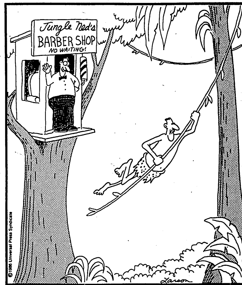
And for two excruciating months, he was simply known as "Skinhead of the Jungle."