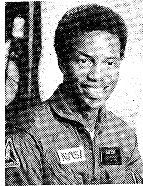
Astronaut, NASA Johnson Space Center College of Engineering