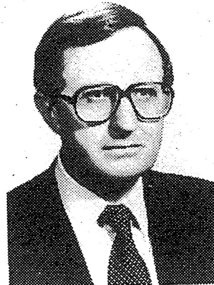
Consultant Borden Corporation College of Engineering