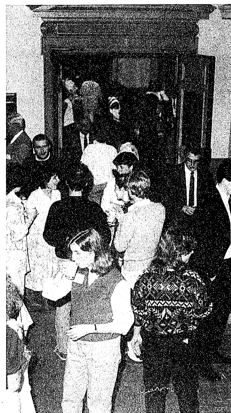
Faculty members, alumni and staff members enjoyed some goodies as well as each other's company during a reception in Carnegie Building Saturday night, April 19.