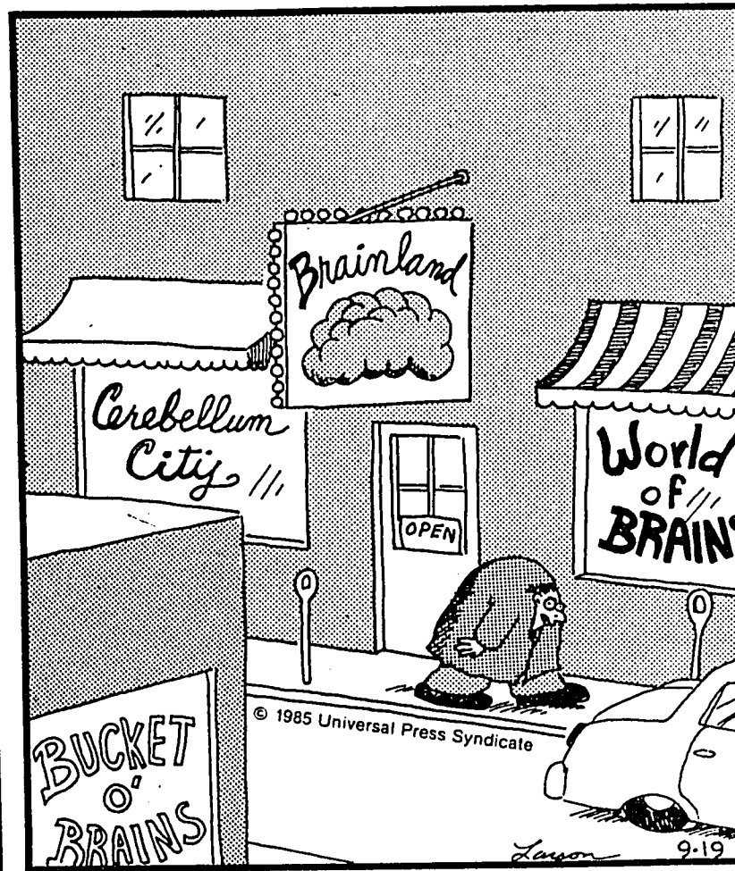
Igor goes shopping